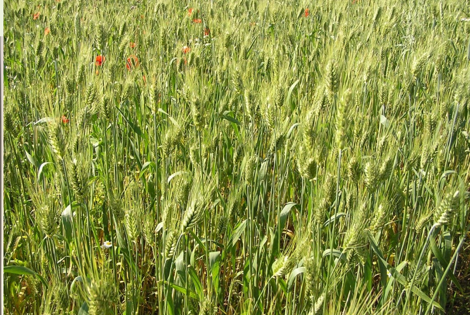
T. ch. Bul. 795 U. S. Dept. of Agriculture