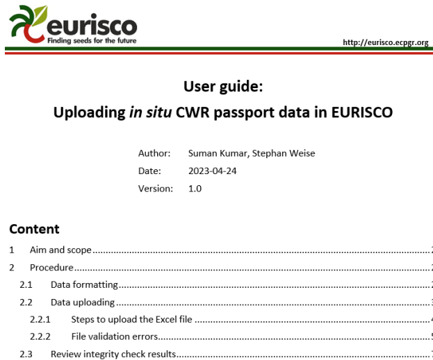
Figure 3: User guide for uploading in situ CWR data.

A user guide for in situ focal points describing the preparation and upload of data was compiled (Figure 3).