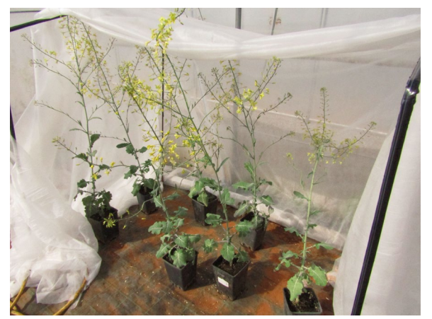
Figure 3. B. incana at flowering stage, IPTPO, Croatia