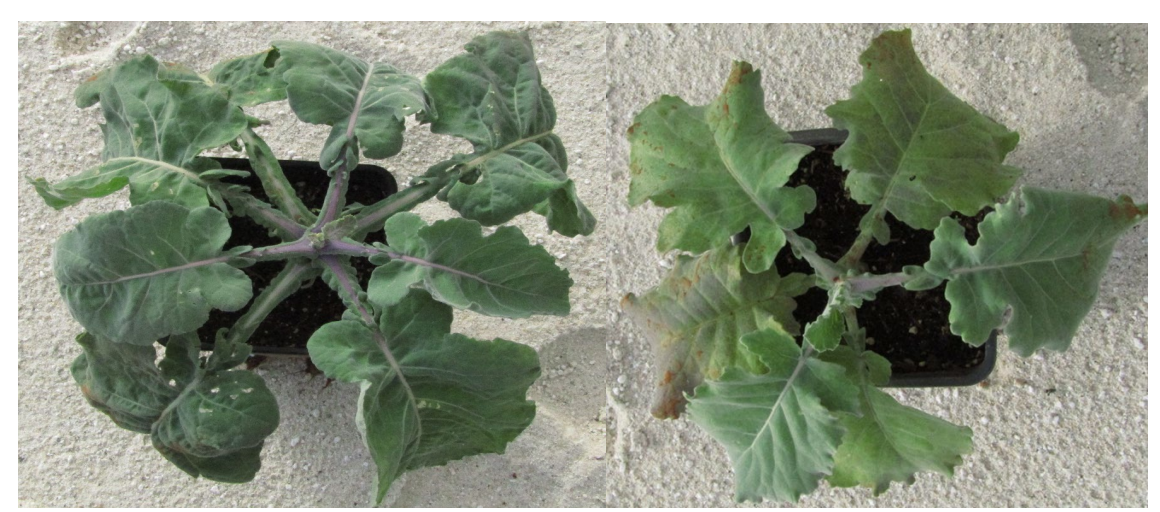
Figure 2. B. mollis (Koločep, left) and B. incana (Vis, right) grown under greenhouse conditions at IPTPO, Croatia

the plants survived the summer and autumn of 2021 and we expect another flowering during spring 2022. We plan to enable controlled pollination using small hives with bumblebees to enhance seed production.