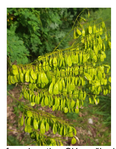
Figure 4. Isatis tinctoria from location Sićevačka klisura, IFVCNS, Serbia

In June and July 2021, researchers from the Institute of field and vegetable crops (Serbia) went on two expeditions at Stara Planina mountain to collect wild Brassicaceae (Fig. 4). During the first expedition, organized 28- 29 June 2021, plant material from eight species ( Isatis tinctoria, Raphanus raphanistrum, Lunaria annua, Alyssoides utriculata, Alyssum orientale, Sinapis arvensis, Aurinia corymbosa, Aurinia saxatilis ) was collected on six locations.