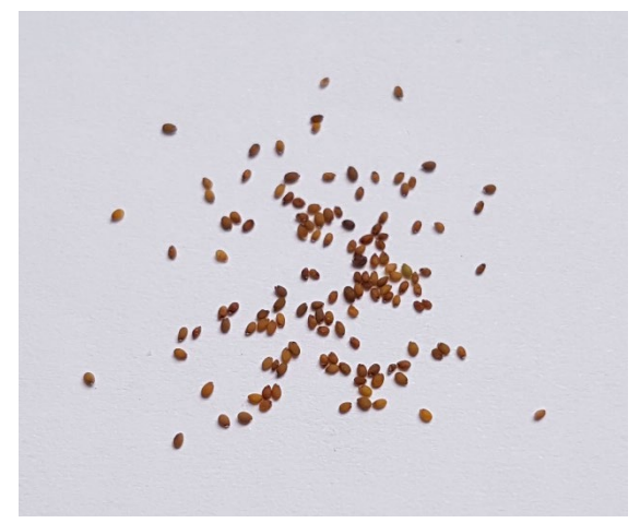
Figure 5. Mature seeds of collected Eruca/Diplotaxis sp., KIS, Slovenia

In addition, some spring/summer collecting expeditions were performed. The mature seeds of one accession belonging to Eruca/Diplotaxis sp. were collected. The unknown wild Brassicaceae accession was found in Zapoge village (46.17823, 14.46273; subalpine climate; central Slovenian region). The plant, along with soil, was transferred to greenhouse pot conditions to obtain mature seeds (Fig. 5) for further project activities/assessments.