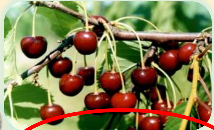
Estonian University of Life Sciences Polli Horticultural Research Centre