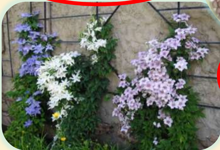
Botanical Garden of University of Tartu