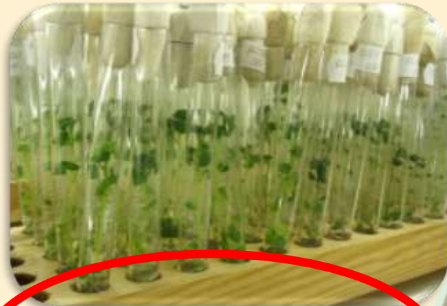
Estonian Crop Research Institute Dep. of Plant Biotechnology