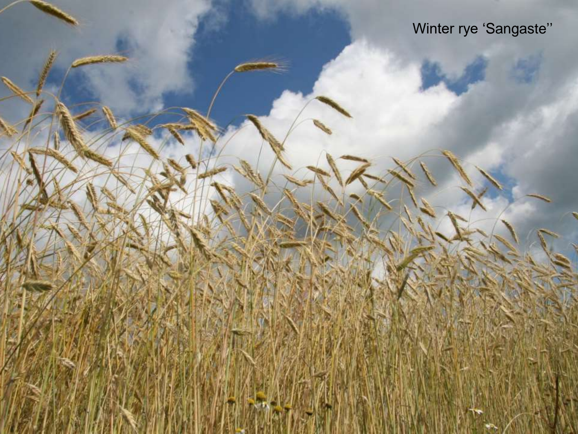
Winter rye 'Sangaste'