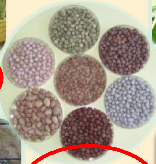
Estonian Crop Research Institute Genebank