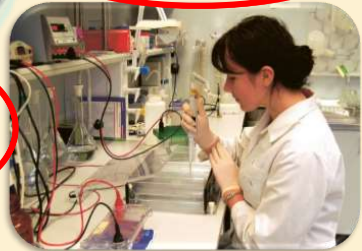
Institute of Gene Technology of Tallinn University of Technology