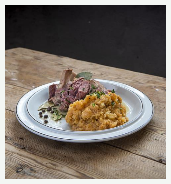
Figure 1. "Rotmos", mashed swedes, is the most traditional dish made from swedes, but has an unearned bad reputation.

In 2015 we began to evaluate landraces and obsolete cultivars of swedes in Sweden for agronomic and sensory characteristics. In parallel, work was initiated of small-scaleseed production and marketing of traditional cultivars. Here, we report on this work and how swedes are now a sought-after crop and served with pride on the best Swedish restaurants.