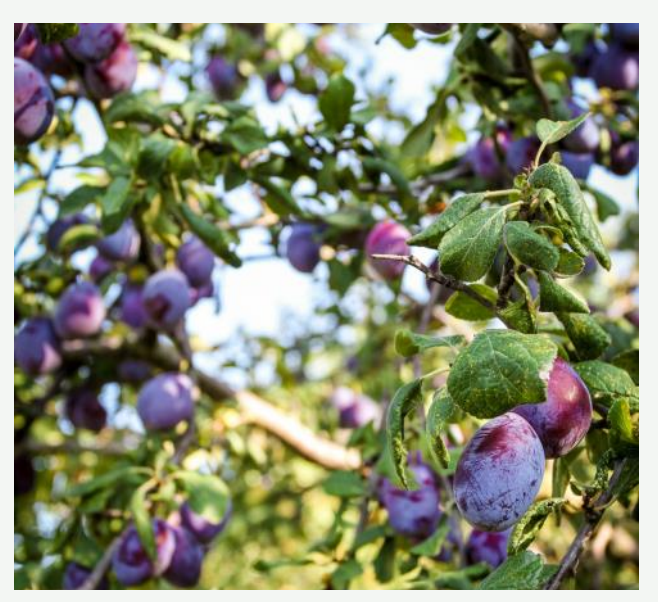
Above: the plum (Prunus domestica domestica L. subsp. insititia L.) landrace 'Mascina di Montepulciano' (Italy).