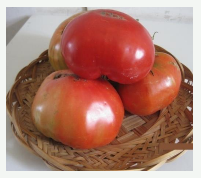
Figure 1. Tomato landrace 'Tavushy'.

result of introducing and mixed cultivation of some old breeding varieties ('Yuvel', 'John Ber', 'Chudo Rinka', 'Fikarazzi', 'Ponderosa', 'Humberg' and others). In the mountain areas of Tavush marz of Armenia farmers cultivated local population of tomato (landrace 'Tavushy'). Landrace 'Tavushy' (Figure 1) created in the past century has been cultivated in the Republic for a long time meeting demand of population in fresh tomato and of a cannery production. The accessions of landrace 'Tavushy' are maintained at the Department of Solanaceae Crops of the Scientific Centre of Vegetable and Industrial Crops (Sarikyan 2003; Sarikyan 2006; Sarikyan et al. 2009).