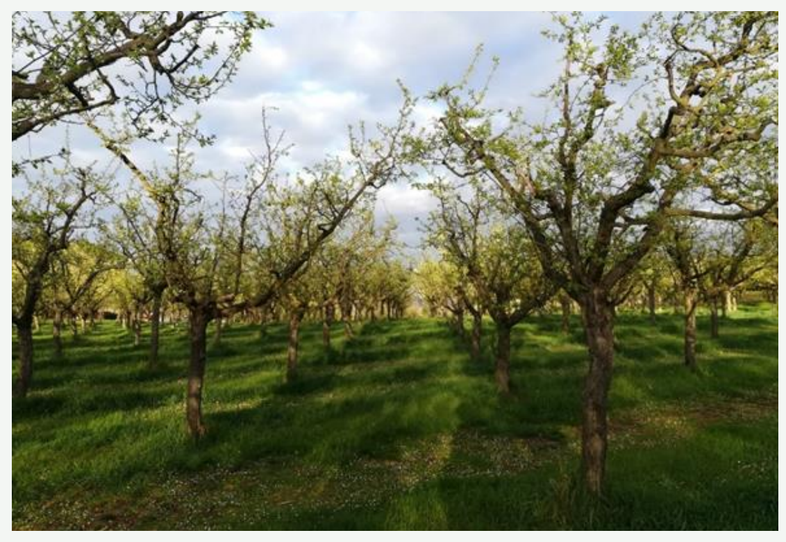
Figure 2: 'Mascina di Montepulciano' orchard in Montepulciano (Siena, Italiy).

In Italy, the attribution of a PAT is an important step in the recognition of a landrace; in fact it is based on evidence that demonstrate the use of a certain landrace (or a processed foodstuff in other cases) in a certain area for at least 25 years (this must be documented case by case).Currently, the Department of Agricultural Food and Environmental Science of the University of Perugia is carrying out phenotypic and genetic characterisation of the landrace in order to promote its registration to the regional register of landraces and to also to favour additional valorisation and conservation intiatives. However, the provisions set by the Italian Ministry of Agriculture and Forestry and 'Regione Toscana' through the PAT recognition and the interest of various local associations grouping farmers potentially interested in cultivating 'Mascina di Montepulciano' helped increasing the perception of the landrace value and generated a renewed interest; all these activities give hope for the on-farm conservation of this landrace in the next future.