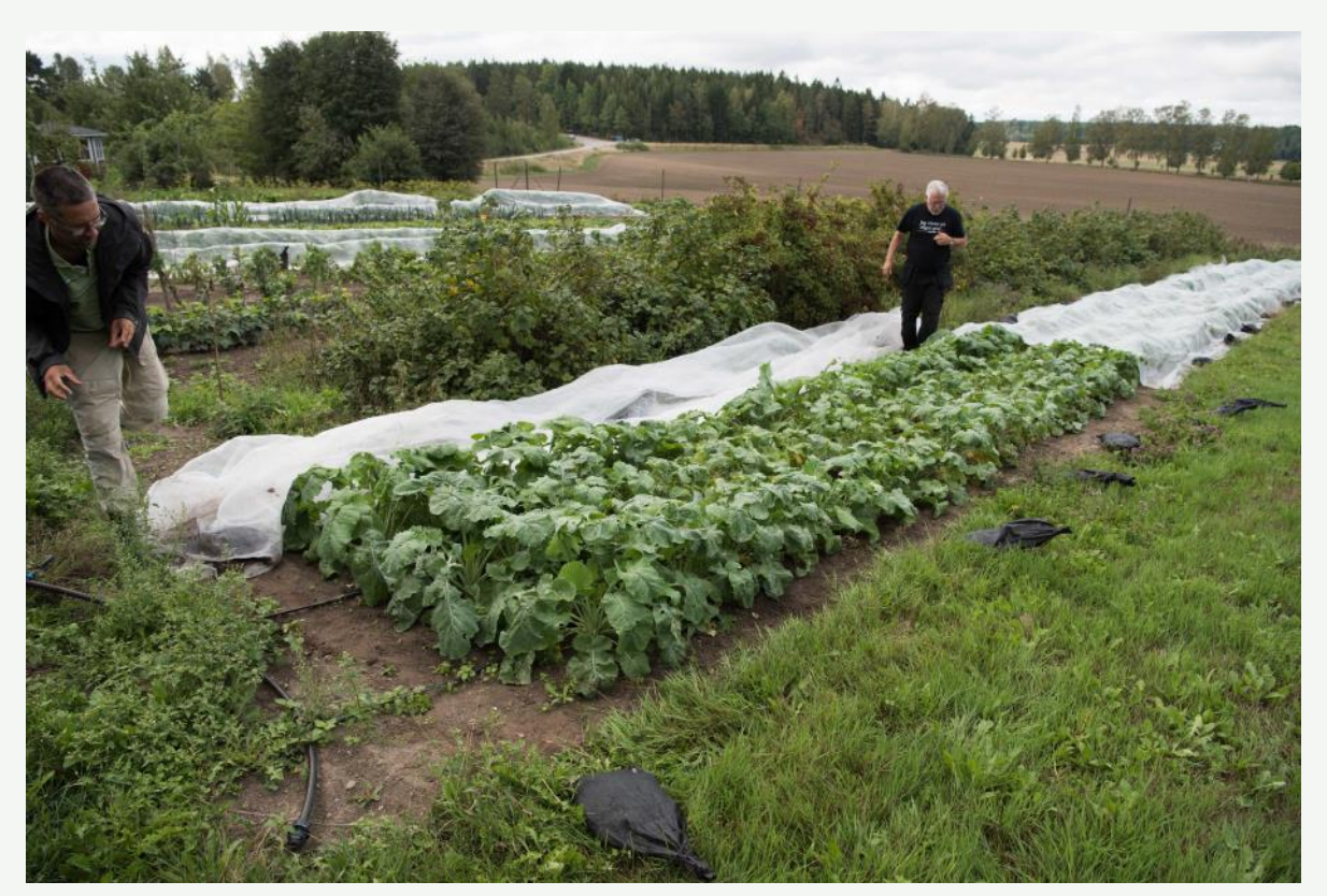
Figure 3. Test cultivation of 50 different accessions.

The different accessions demonstrated a great variation for many characters. An obvious difference was that swedes of fodder type had a much later root development and generally produced larger roots. The susceptibility to mildew also differed markedly between the varieties.