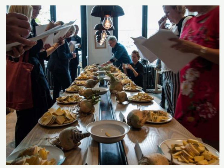
Figure 4. Palatability test of 50 different swedes at the Rutabaga restaurant.

Re-establishment of the swede on the market requires both that its value as food is restored and that seed is available. Seed production is perhaps the greatest obstacle. As mentioned earlier, the Swedish swede accessions are long-term preserved at NordGen. Here the accessions are preserved for future food supply and are mainly used for research and plant breeding. But it is also possible to order smaller seed quantities for further propagation. This propagation requires knowledge, space and time. Today, 4-5 000 tonnes of swede is produced commercially in Sweden (Statistiska centralbyrån, 2019). The production for own use is probably negligible. The number of varieties is low. Thus, there is potential for growing more varieties of different qualities since, with greater diversity, demand would be expected to increase, as would GDP (Gross Domestic Product).