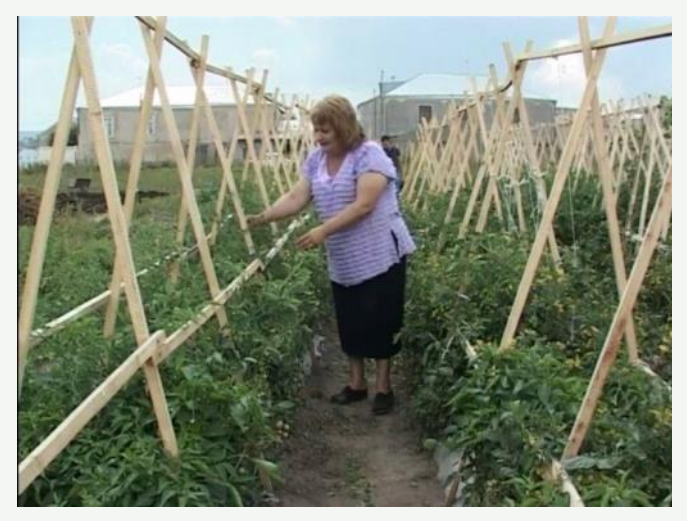
Figure 2. Tomato landrace cultivation through application of modern cultivation technologies.

Armenian old varieties and landraces are not very productive and fruits are not transportable, but their palatability traits are very high. Today local population expresses dissatisfaction with modern high productive tomato varieties with high transportation ability and prefers to have old ones in their everyday food. However, the traditional cultivation technologies and methods are not enough to ensure quality and high yield of old varieties. To help farmers to get higher yield from old breeding varieties and landrace, modern cultivation technologies developed by the Asian Vegetable Research and Development Center (AVRDC) such as mulching plant beds with polyethylene foil, plant forming, cultivation with sticks (Figure 3), drip irrigation, were studied and proposed to farmers.