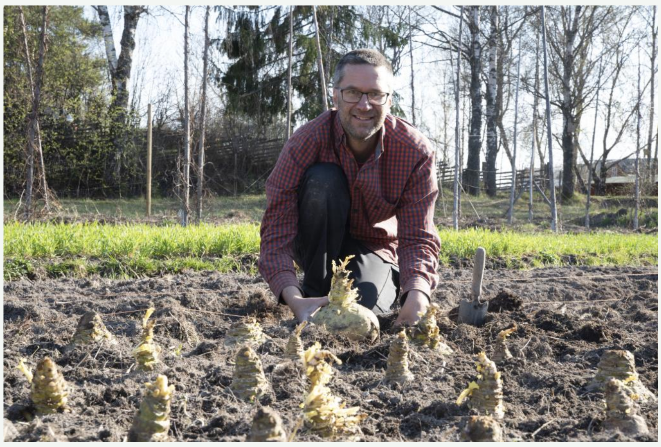
Figure 6. Transplanting swedes from last year for seed production. Also rather small seed production plots can produce enough seeds for large scale cultivation.

The difficulties with seed production are, however, several. The first, and most problematic, cumber is to engage growers who are willing to carry out this small-scale craft, yielding only limited amounts of seed. Another problem is that the swede is cross-fertilized and insect-pollinated. Being botanically speaking the same species as rapeseed, seed production in rapeseed districts is excluded. Risk of cross-fertilization also prevents the same grower from growing several varieties at the same time, unless each cultivar can be safely protected from pollinated insects.