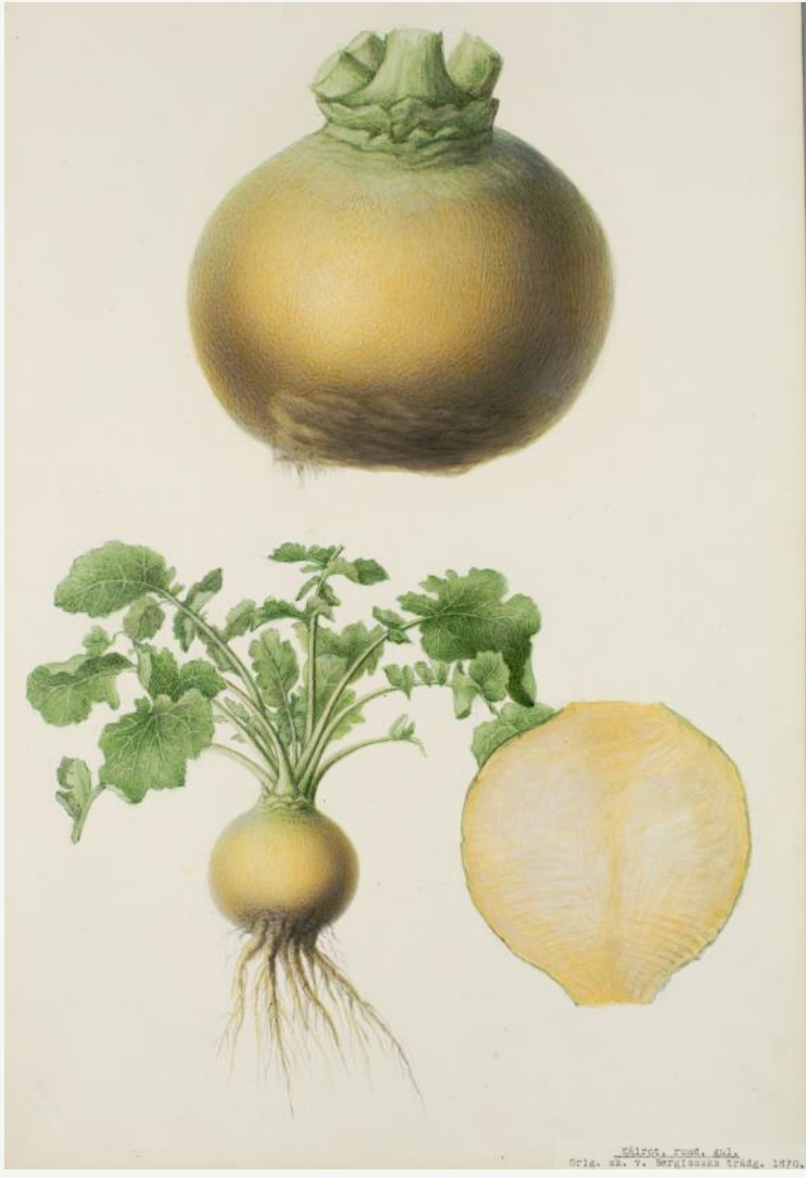
Figure 2. 'Swedish Yellow Swede', is considered as the cultivar being closest to the original swede. Illustration by Henrietta Sjöberg 1870.

The observation that such a large number of unknown landraces or local cultivars of swedes were still grown and maintained in Sweden in the early 2000's came, as mentioned, as a surprise to many of us. Being a biennial crop, that flowers and sets seed only the second year following winter storage of the roots, means that maintaining the landrace is labour intensive. Still, the range of anecdotes to accompany the donated accessions revealed very close relationships between the crop and its caretakers, very often over several generations (Nygårds and Leino 2013). While the Seed Call aimed at finding most of what was still grown "out there" in terms of unknown cultivated diversity, we cannot rule out that