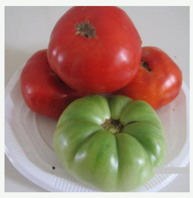
Figure 2. New tomato variety 'Aspram'.

Taking into consideration the fact that farmers use mainly organic fertilizers while cultivating the tomato landrace and old breeding varieties a new bio-preparation "ECOBIFID PLUS" produced in "ArmBioTechnology" Scientific and Production Center of the National Academy of Sciences of Armenia was tested and offered to farmers to increase yield and preserve palatability traits of tomato old breeding varieties and landrace.