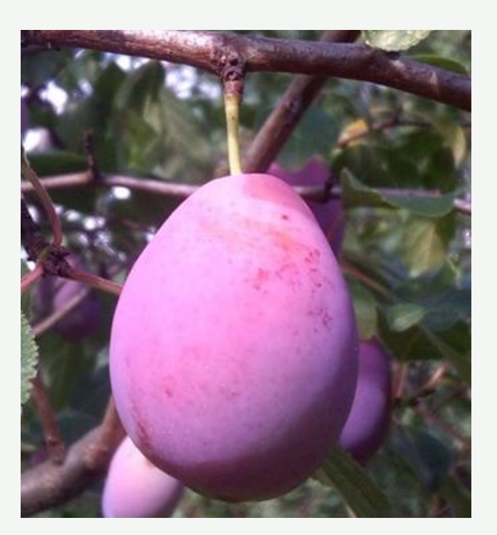
Figure 1: 'Mascina di Montepulciano' fruit.

Plants of 'Mascina di Montepulciano' ( P. domestica L. subsp. insititia ) are characterised by weak vigour and compact tree habit. Fruits are typically purple, covered by a thick layer of bloom and are characterised by a yellow flesh (Figure 1); at maturity seeds are well attached to the pulp; fruit shape is typically oblong. Fruits of 'Mascina di Montepulciano' are very appreciated for their high content in sugars (sweet) but at the same time by high content of compounds that provide a strong sour taste. Plants appear to be extremely resilient and within the cultivation area are traditionally used to produce 'wild' rootstocks for other P. domestica varieties.