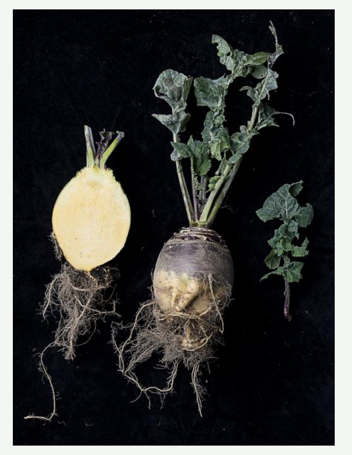
Figure 5. 'Nusnäs', a landrace from the province Dalarna, received most top scores at the palatability test.

While we do not expect that production of these unique varieties would be comparable to the current commercial production of swede, we are certain that a larger assortment of varieties on the seed market could increase interest in home garden cultivation.