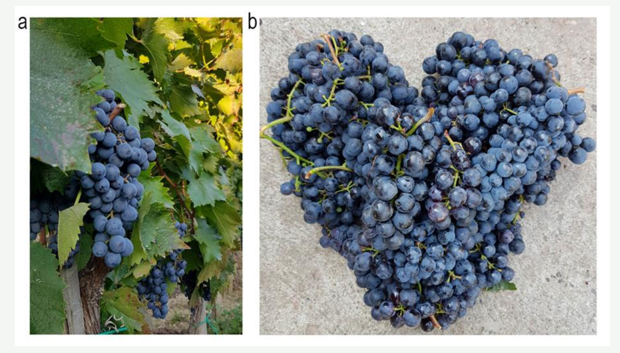
Figure 1: 'Seduša' grapevine landrace. a: grape at harvest;; photo: Ivana Sijacki Majorosi b: grape, detail; photo: Aleksandar Tabaković, Ministry of agriculture, forestry and water management Belgrade, Serbia.

The resulting wine is characterised by a light ruby colour, with a lot of earthy and mineral tones, while, at the same time, fruity with clear aromas of currants and cherry plum. The resulting wine is quite high in alcohol content that does not interfere with the balanced aromas.