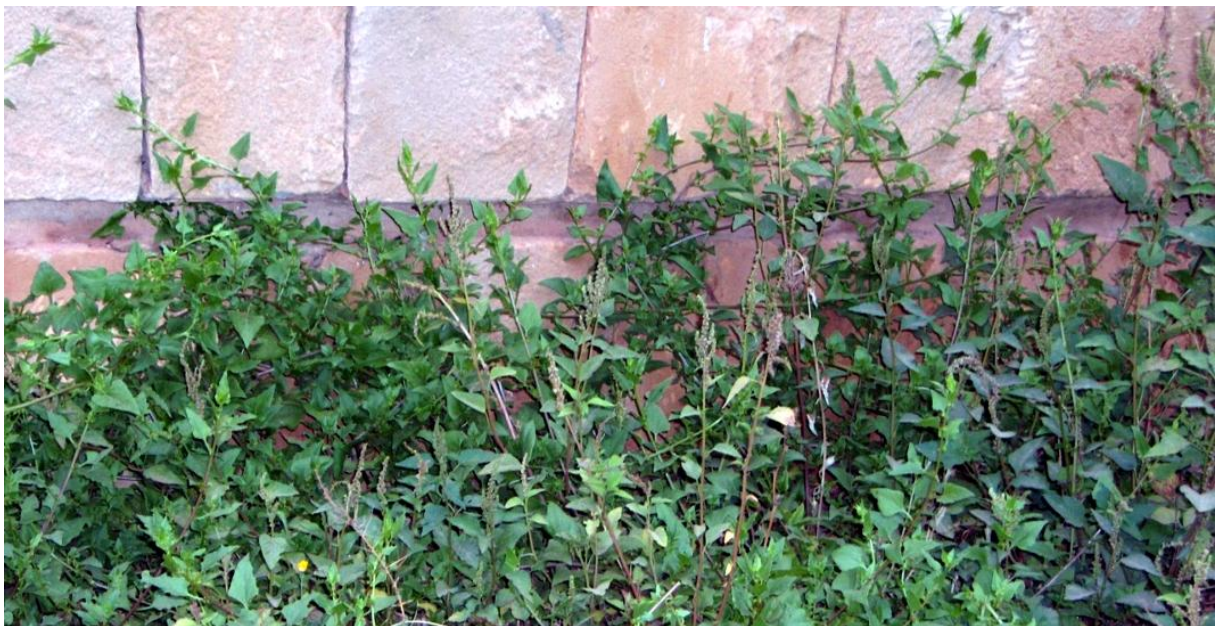
Patellifolia occurrence in southern Morocco

To start with I would like to tell you about my story on beets. Before I became the representative from Morocco in the WBN, very little was known about the exiting wild beet species. I have started my project on the inventory and taxonomic determination of Moroccan wild beet species in 2005. It was not just difficult ... IT WAS A CHALLENGE. Despite the great interest in Beta / Patellifolia species in fundamental and applied breeding research it was hard to get a project funded and to make this group of crop wild relatives to one of the national research topics.