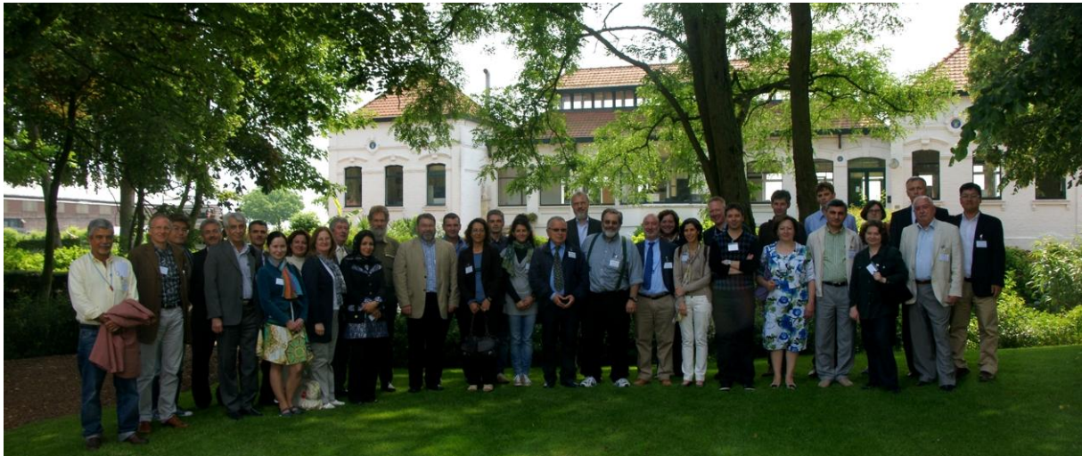
Participants of the fourth joint meeting of the ECPGR working group on Beta and the WBN, 20-22 June 2012, Cappelle-en-Pévèle, France