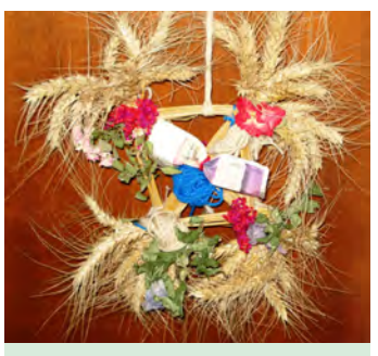
Grain garland hanging over the harvested grain, for abundance and happiness.

Unfortunately, these traditional ceremonies are gradually disappearing in Macedonia, but the experimental field station at the Institute of Agriculture in Skopje is deeply motivated in keeping them as part of its rich, cultural heritage.