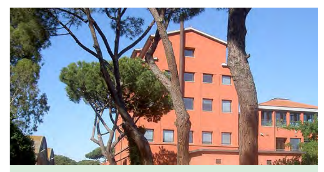
The Headquarters of Bioversity International in Maccarese, Italy.