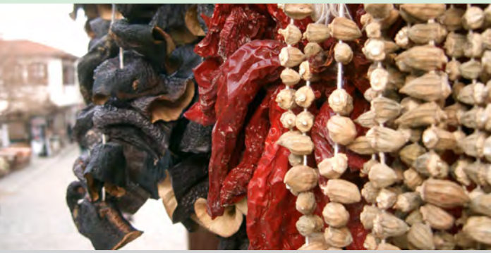
Top: Ancient ruins of Ephesus, Turkey. Bottom: Dried eggplant, pepper and okra at Sirince market, Turkey.