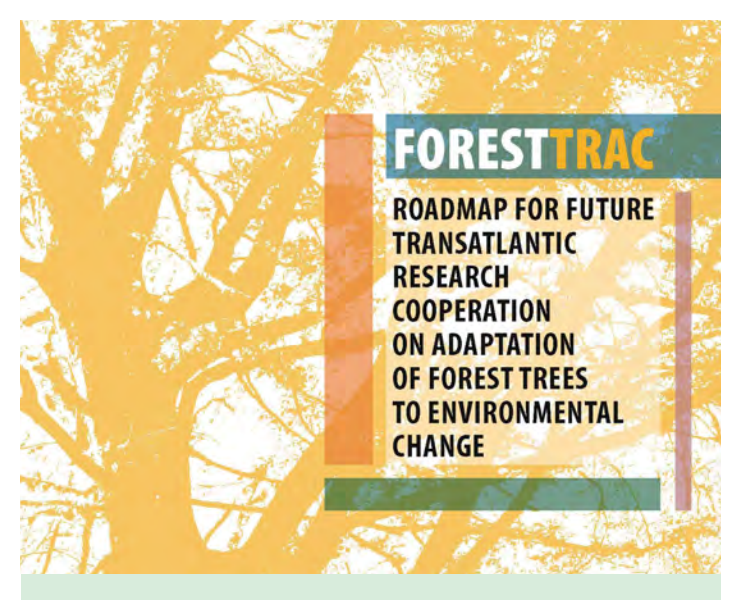
Draft of the FORESTTRAC strategic roadmap.

"We have evidence that these mechanisms are active because they contributed in the past to adaptation during natural global warming. We now need to evaluate how they will operate in different ecological settings in North America and Europe", he says.