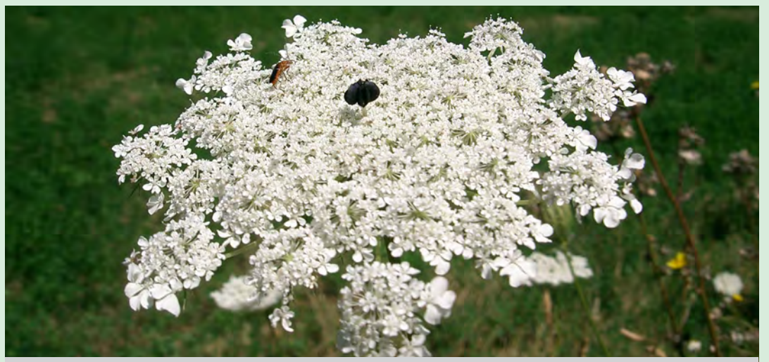
Recognizable by its distictive central black flower, wild carrot (Daucus carota).

In summary, the project was successful in designing a workflow for the selection of MAAs in carrot which can be applied to the other umbellifer crops. This very necessary work is required in order to identify accessions to be held as part of a European Collection within AEGIS so that the collection represents an appropriate balance between maintaining genetic diversity and reducing redundancy.