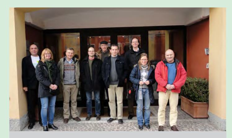
EUFORGEN Working Group on genetic monitoring during the first meeting in Maccarese.

Recently, two new EUFORGEN Working Groups began preparations for further actions on conservation and monitoring of forest genetic resources in Europe. The first group is developing a pan-European genetic conservation strategy for forest trees. This work builds on the earlier efforts carried out by the EUFORGEN Networks and the EUFGIS project (Establishment of a European Information System on Forest Genetic Resources, 2007-2011). The second group is reviewing options and methods for genetic monitoring of dynamic conservation units of forest trees in Europe.