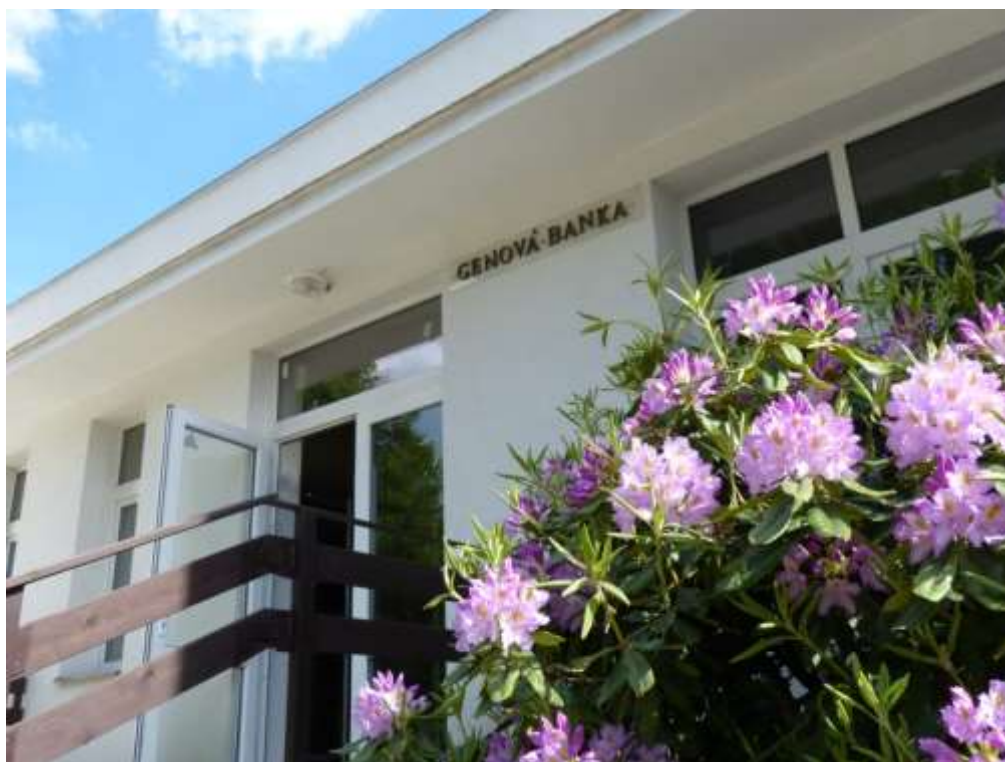
A view of the CRI Genebank, which the participants visited on Wednesday 21 May.