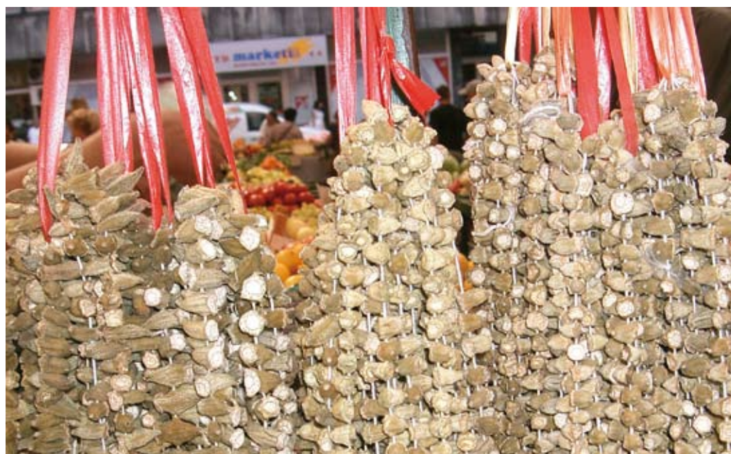
Dried okra (Abelmoschus esculentum) fruits sold at the vegetable market in Sarajevo.

We invite you to send your ideas and contributions for this Newsletter to Bioversity's Regional Office for Europe by Email to bioversity-europe@cgiar.org . Please send all contributions for Issue 38 by 20 March 2009 .