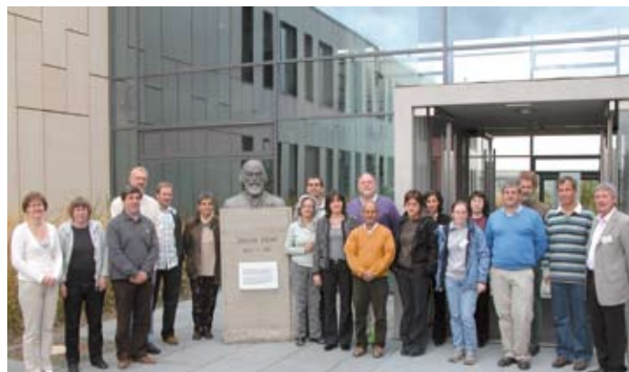
Participants in the AEGRO coordination meeting.