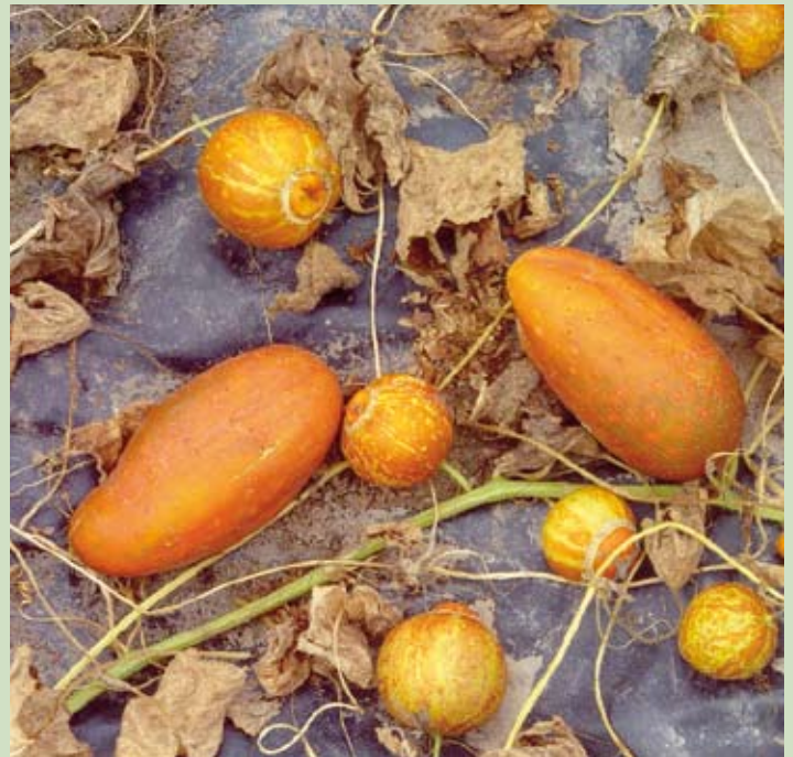
A selection of cucurbits from the Polish Cucurbitaceae germplasm collection.

The background, goal and scope of AEGIS, as well as the concept of the Most Appropriate Accessions (MAAs) and the role of the Working Groups in the implementation of AEGIS, were explained by the Chair and the Vice-Chair. Using the example of the