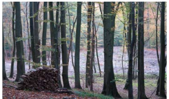
A corner of the Rude Skov forest in Birkerød, Denmark.

The principles of genetically sustainable forest management were mentioned during the Conference. Along with tree breeding and biotechnology, they are of particular importance in promoting the adaptation of forest