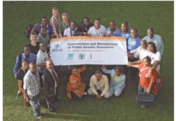
Participants of the Austria funded training course in Ethiopia.

The participants had the opportunity to learn how to apply principles of conservation genetics in practical forest management in African landscapes. The programme included lectures on conservation of tree seeds, measurement of genetic variation in tree populations and conservation strategies for threatened African tree species. There were also group work exercises and case studies on changes in African forest ecosystems, trees on farms,