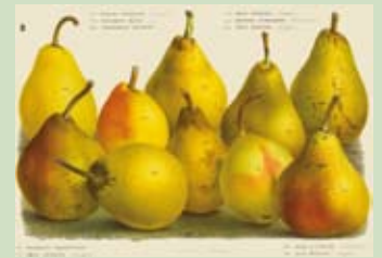
Illustration of a diversity of pears. Image: "Nos Poires", Ets Horticoles Louis Van Houtte, courtesy of J. Bosschaerts, Anvers-Antwerpen, Belgium

European fruit tree experts from Belgium, France, Germany, Hungary, Italy, Romania, Macedonia FYR, the Netherlands, Switzerland and UK subsequently analysed the DB accessions for Malus , Pyrus and Prunus with the objective of validating lists of synonyms, according to the best reference books for each crop, in order to identify the Most Appropriate Accessions (MAAs) to be included in the European Collection, currently being defined by the AEGIS initiative. They also checked the traceability of bibliographic encoded references.