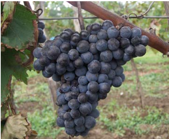
Grapevine production is one of Georgia's prime agricultural activities.

The Study emphasized that Georgia's rich agricultural legacy of traditional crops must be conserved and used to advance agricultural productivity in Georgia. Traditional varieties could be used to develop niche markets for the preparation of traditional foods, thereby providing new markets and generating income for local farm communities. Georgia is also rich in wild species, many of which are genetic relatives of cultivated plants and may serve as genetic resources to solve serious limitations in crop production, such as susceptibility to pests and diseases. It is essential to secure this rich biological resource indefinitely through a strong national, integrated and coordinated PGRFA management strategy. Considerable interest has been shown by the national authorities to follow-up on the Study. As in the case of Armenia, long-term assistance, cooperation and funding will be essential for the improvement and effective use of Georgia's PGRFA for food security.