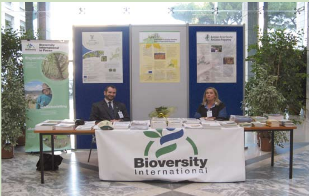
Bioversity International booth at the European Forest Week (FAO, Rome).

Bioversity International also set up a booth at FAO to distribute publications and display posters of EUFORGEN, EUFGIS and EVOLTREE. The presentations of the Bioversity side event are available at www.europeanforestweek.org/51336/en/ . Further information on other events held during the European Forest Week can be found at www.europeanforestweek.org .