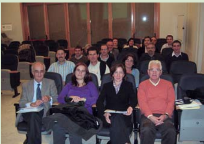
Participants of the EURISCO training-seminar in Madrid.

A EURISCO training-seminar was held on 3-4 November 2008, in Madrid, Spain, organized by INIA-CRF, Spain and the EURISCO Coordinator from Bioversity International. This is the start of a potential series of training-seminars envisioned to be held in other countries.