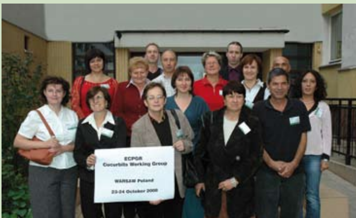
Participants in the ECPGR Cucurbits Working Group meeting.

All the participants thanked the local organizers for the excellent meeting.