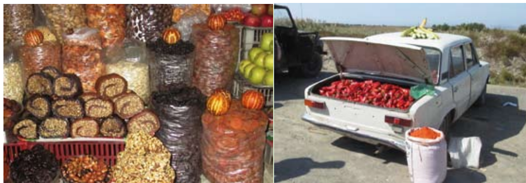
Armenia's rich diversity: dried fruit on sale in a Yerevan market and a car boot sale of peppers and paprika.

Armenia maintains a series of germplasm holdings; ex situ genebanks, in situ reserves, agro-ecosystems and protected natural ecosystems, working collections for research, breeding or teaching purposes, as well as information/documentation systems, as a result of