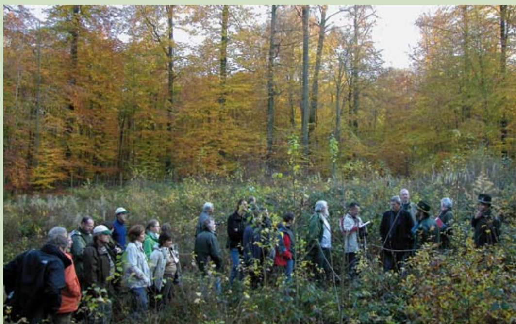
The meeting participants observing natural regeneration within a fenced plot in the Sonian Forest.

A summary report of the meeting is available at the EUFORGEN website ( www.euforgen.org ).