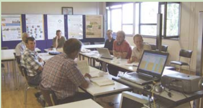
The pear experts group working on the list of pear synonyms.