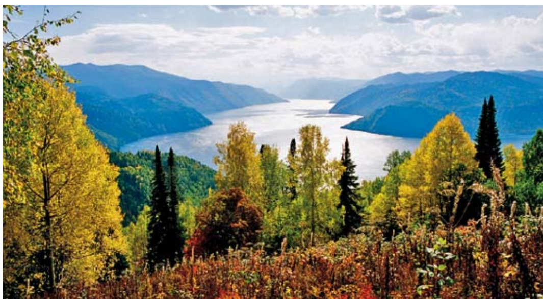
View of the Teletsky Lake from the Altaiski State Nature Reserve, Altai Region, Russian Federation.

The International Conference on the "Role of Forests in Climate Management: Research - Innovations - Investments - Capacity Building" took place on 4-7 October 2008 in St. Petersburg, Russian Federation. Organized by the Federal Forestry Agency of Russia's Ministry of Agriculture, the conference was attended by scientists, practitioners and forest managers from all over Russia, plus a few participants from abroad. The World Bank and FAO co-hosted the conference.