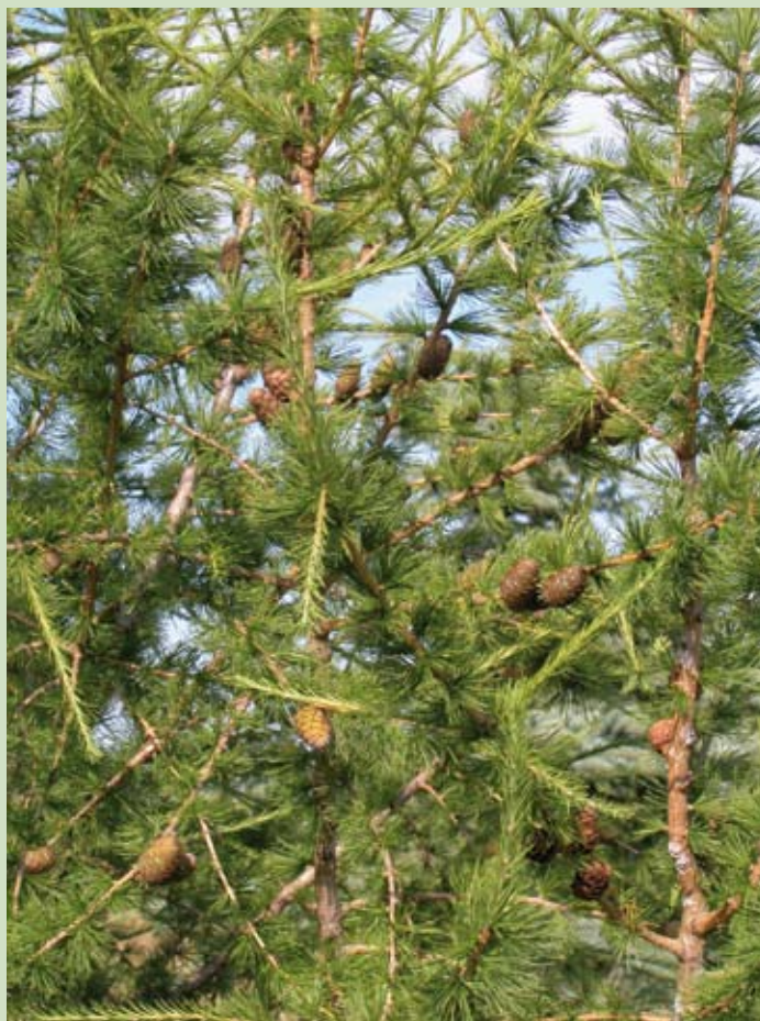
Seed orchard of European larch ( Larix decidua ) near Sárvár, Hungary.

The Network further discussed selection of genetic material for given site conditions and how climate change is expected to impact on this. In marginal environments in particular, the adaptive potential