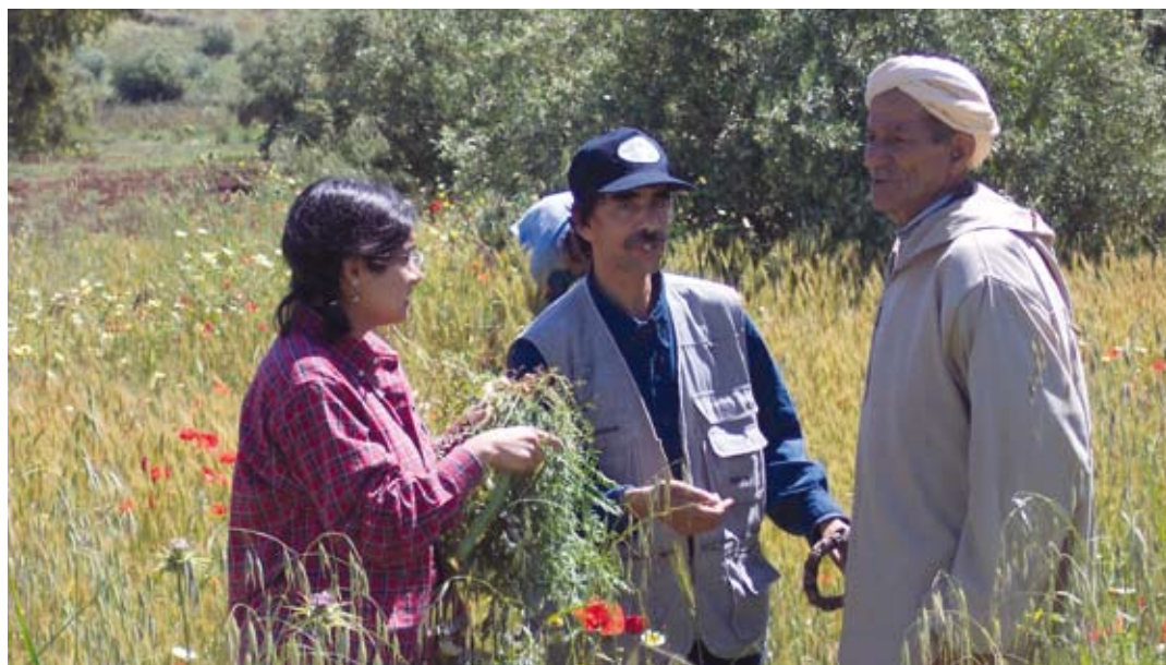
A student collecting indigenous knowledge from a Moroccan farmer during a Conservation Field Course.

The international reputation of the University of Birmingham in the conservation and utilization of plant genetic resources (CUPGR) is well established. Professor J.G. "Jack" Hawkes established the Conservation and Utilization of PGR (CUPGR) programme in 1969 and since then short course and master's degree training has been provided to over 1500 students from 92 countries - many Birmingham graduates now fill key roles in international, regional and national conservation agencies. We are very proud of our past graduate employment rate, with about 95% of our graduates obtaining employment in conservation (e.g. protected area management, seed conservation, conservation and genetic research and environmental monitoring) or related fields (e.g. agriculture, genetics, database administration, plant breeding, taxonomy, management and teaching). However, a recent periodic review indicated a growing requirement from trainees and potential employers for a greater research focus to the training and closer links with industry. To meet this demand the new