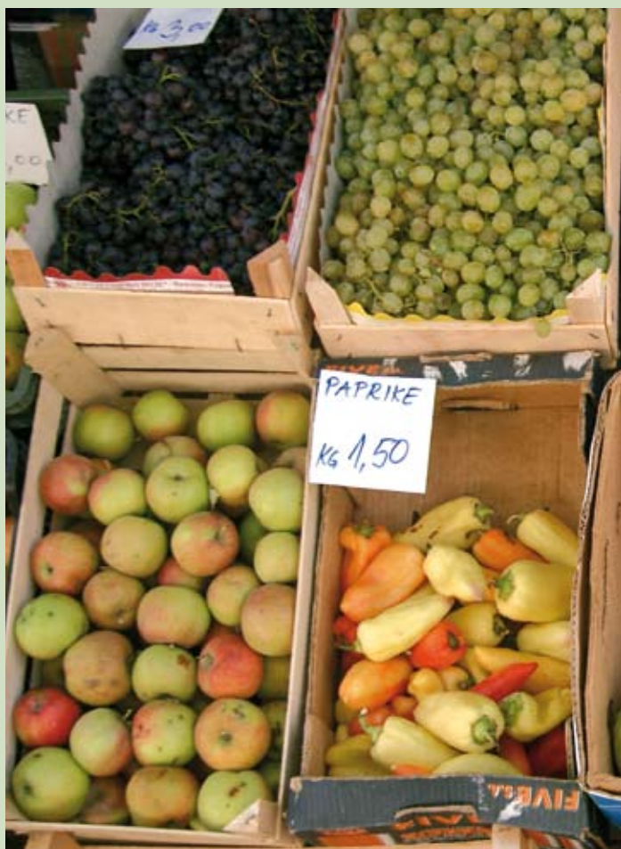
Fruit and vegetables on sale at the market in Sarajevo.

Accessions proposed as European Accessions must meet the general selection requirements adopted by the ECPGR Steering Committee: a. Material under the management and control of the member countries and their associate members, in the public domain and offered by the associate members for inclusion into AEGIS; b. Genetically unique within AEGIS, to the best available knowledge (i.e. genetically distinct accessions; assessment based on available data and/or on the recorded history of the accession); c. Plant genetic resources for food and agriculture as defined in the International Treaty as well as medicinal and ornamental species; d. European origin or introduced germplasm that is of actual or potential importance to Europe (for breeding, research, education or for historical and cultural reasons).