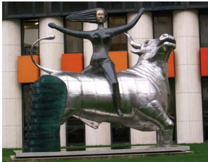
Statue symbolizing the Greek myth of Zeus and Europa, seated in front of the European Parliament, Strasbourg, France.

The outcomes of the workshop were presented by staff of the French Foundation for Research on Biodiversity (FRB) at the Conference of the French Presidency of the European Union "Biodiversity and Agriculture", Montpellier,